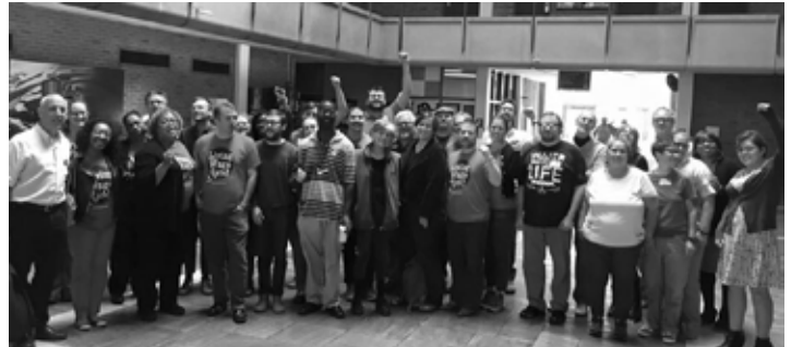
(Below) Union members unfurled a petition dozens of feet long in the halls of the state Capitol.

What Haslam and his cronies had hoped to be a fast-paced project in secret has been anything but that. Because of the workers' determination the governor's